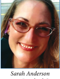
8429 Rosalind Ct.